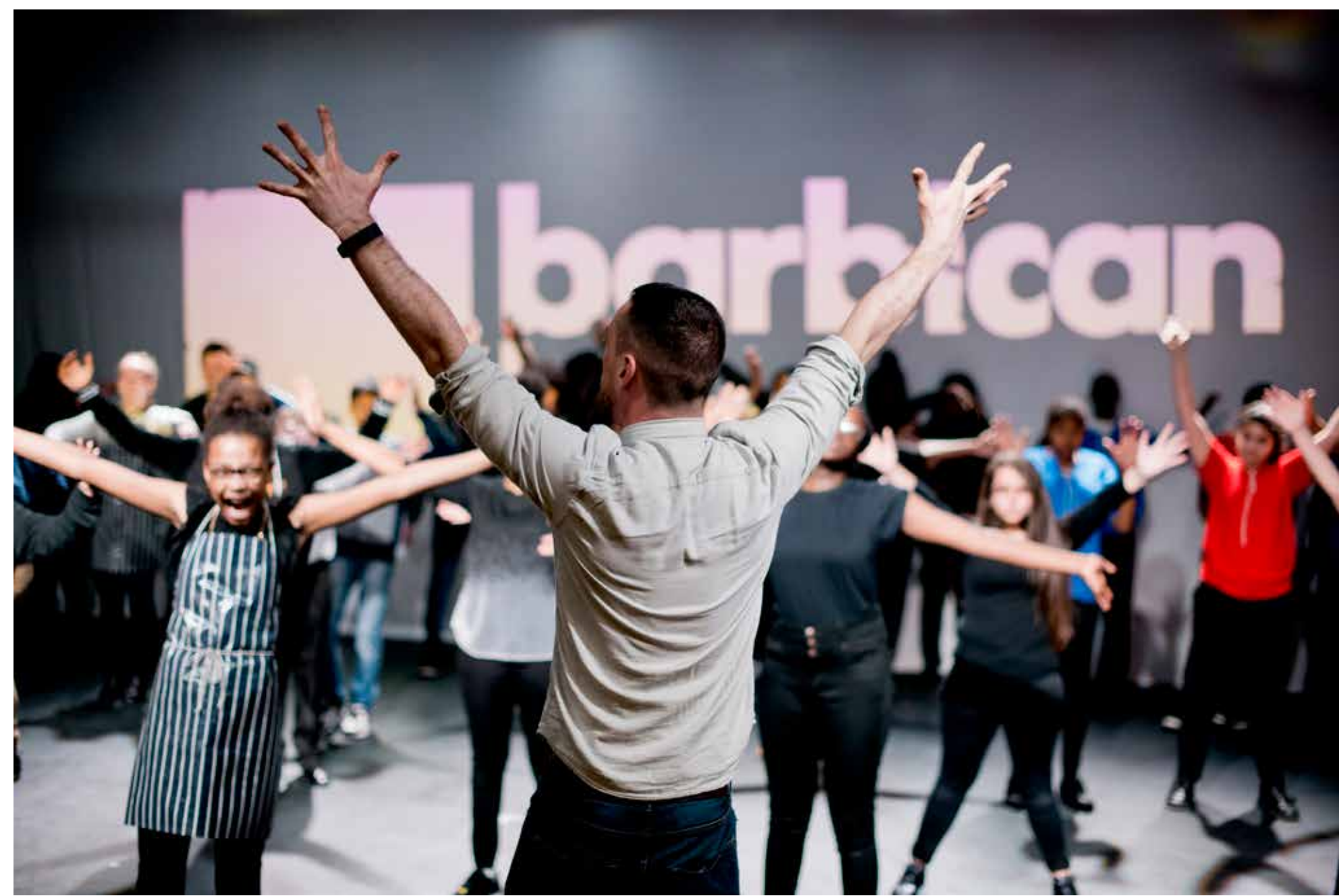
Barbican Box