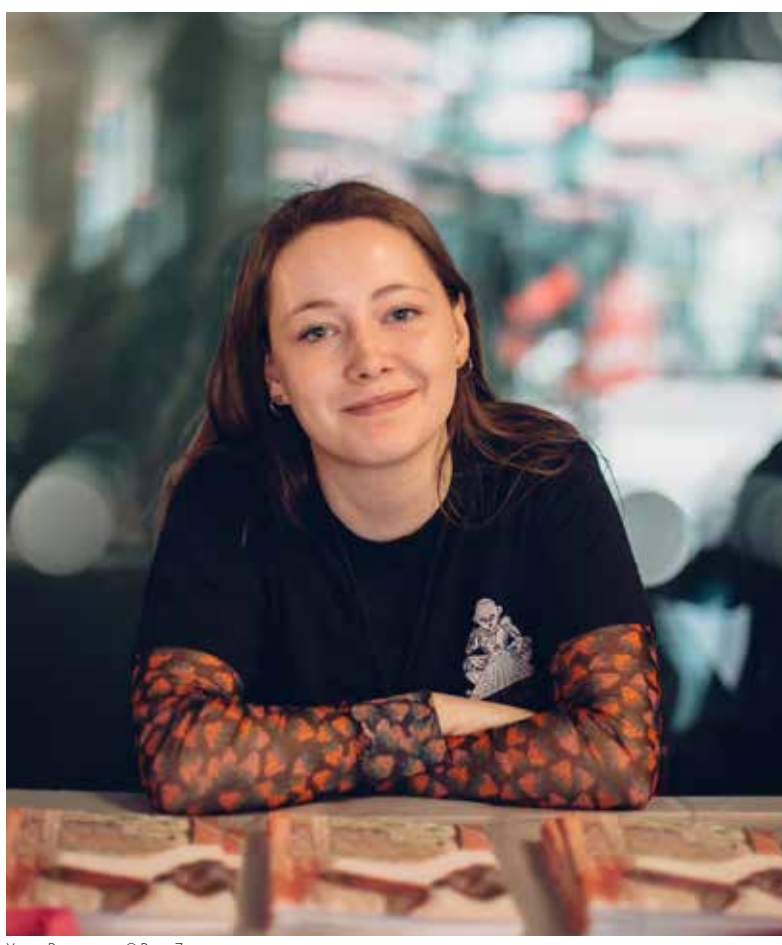
Young Programmer © Betty Zapata

Career pathways of Young Programmers alumni include film-making, working in film curation at well-known institutions, film marketing, running cinemas, programming their own pop-ups, writing, studying, and having their own films screened at festivals.